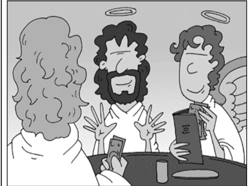
THE SON AND THE HOLY SPIRIT ALWAYS PICK UP THE CHECK ON FATHER'S DAY